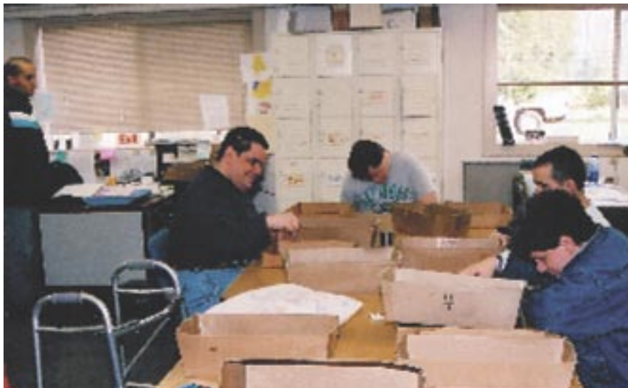
Assembly and packaging are examples of AtWork!'s Production capabilities.

AtWork! 690 NW Juniper Street Issaquah, WA 98027